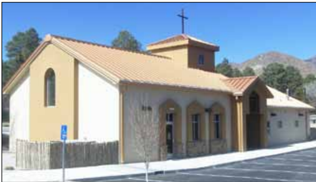
Redeemer Evangelical Lutheran Church's new sanctuary in Los Alamos, N.M., was dedicated March 13.