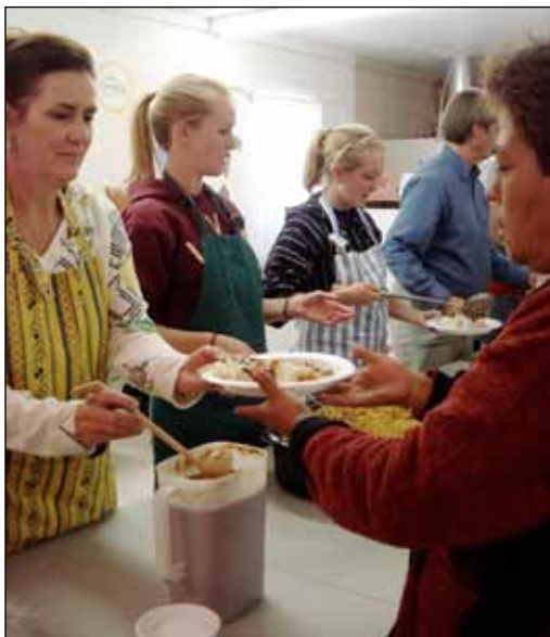
The youth from Our Father, Centennial, Colo., added an extra ingredient—love—for Christ and their fellow man as they cooked for and served hundreds of people in El Paso and Mexico.

YLM is very grateful to the youth of Our Father who make this long trip every Thanksgiving. Our Father plans to participate in a summer servant event at YLM this year also.