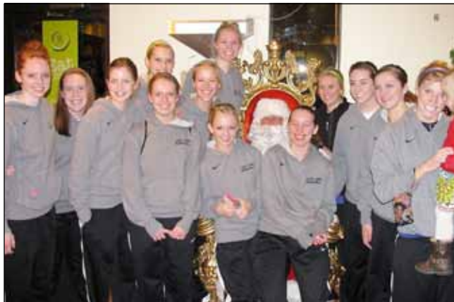
The Lady Lions took time out from intense basketball play in Las Vegas to visit Santa. Their team Christmas wish came true with two wins!