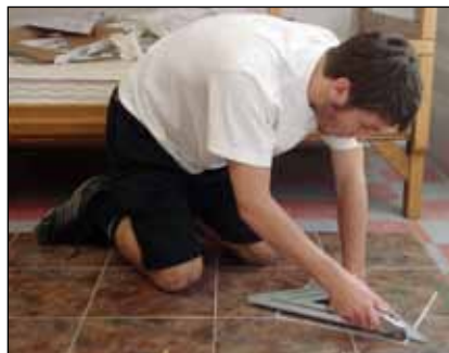
The youth learned that precise measuring and cutting were essential to a good tile job—and discovered what a difference a good tile job can make to a room's overall appearance!