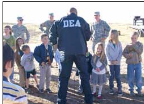
Students at Trinity Lutheran listen attentively to the DEA officer talk about his job and Red Ribbon Week.

Citizens in his hometown of Calexico, Calif., donned the ribbons to emphasize the need for increased prevention efforts. In 1988, Red Ribbon Week became a national campaign. For more information on Red Ribbon Week, visit www.imdrugfree.com .