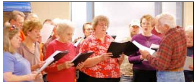
The chancel choir from Immanuel sings God's Word to those enjoying lunch at Loveland's Community Kitchen.