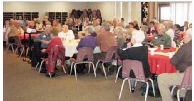
Seniors enjoyed the beautiful weather and the excellent speakers at this year's one-day seminar.