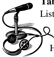
Table Talk Radio 990 AM Denver 2:05 pm Sundays

DOXOLOGY offers an innovative program of advanced study retreats to strengthen pastors for the task of faithfully shepherding the souls entrusted to their care. DOXOLOGY provides pastors with a unique study and renewal experience, rooted in the classic art of spiritual care and informed by the insights of contemporary Christian psychology. DOXOLOGY training retreats will be held in 2010, beginning April 25-28 at St. Malo's Retreat Center. For more information, please visit www.doxology.us .