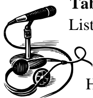
Table Talk Radio 990 AM Denver 2:05 pm Sundays

DOXOLOGY offers an innovative program of advanced study retreats to strengthen pastors for the task of faithfully shepherding the souls entrusted to their care. DOXOLOGY provides pastors with a unique study and renewal experience, rooted in the classic art of spiritual care and informed by the insights of contemporary Christian psychology. DOXOLOGY training retreats will be held in 2010, beginning April 25-28 at St. Malo's Retreat Center. For more information, please visit www.doxology.us .